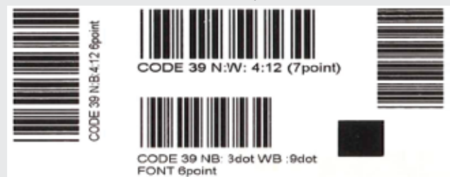
Rough Coated Paper