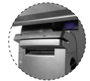
Optional built-in MSR, smartcard reader, finger print sensor and RFID reader