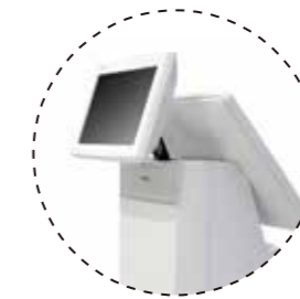
Optional 2nd display