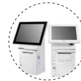
8"/9.7" LCD display with resistive touch