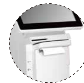
Built-in 3" thermal printer