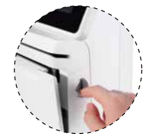
Easy paper roll access