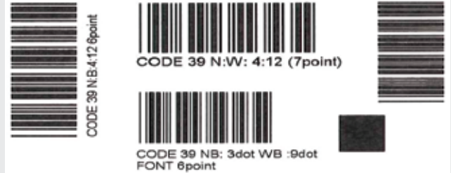
Rough Coated Paper